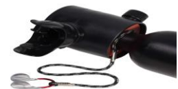
P/N 959 – Nose Clip with Lanyard